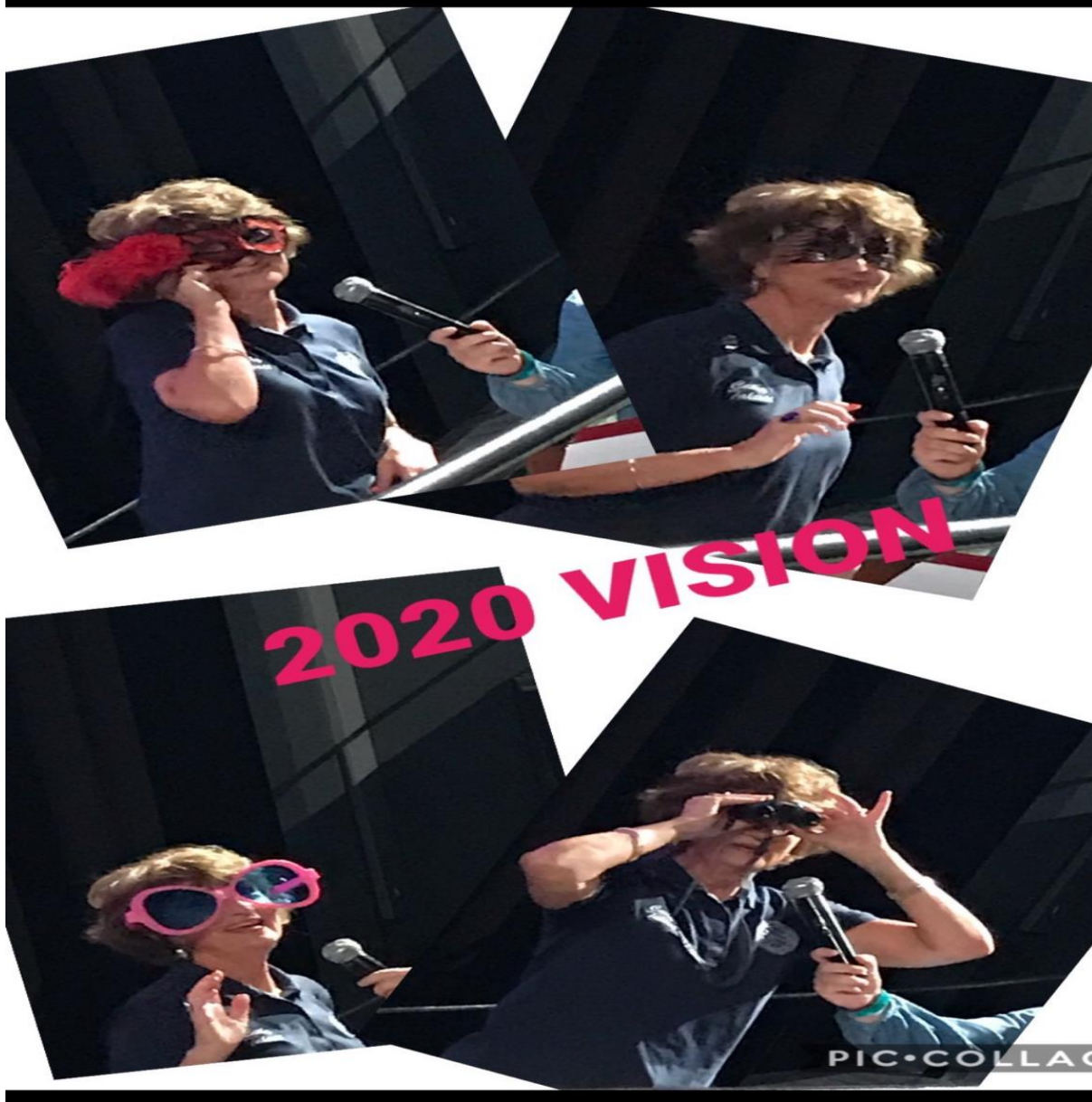
Pic Collage by Becky Robles