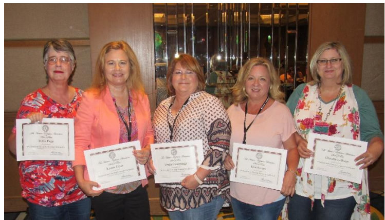
PCAC and PDAC Certificates