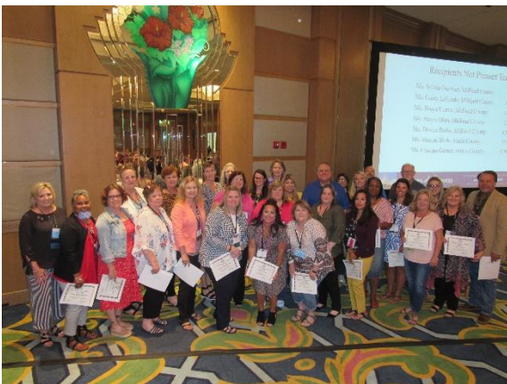
PCC and CTOP Certificates